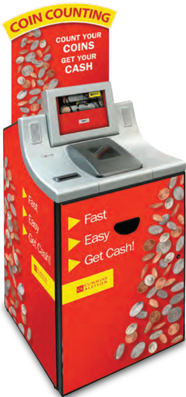
Attractive machine graphics bring attention to your coin counter and help increase usage.