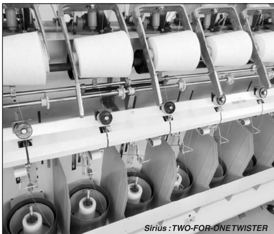
Sirius : TWO-FOR-ONE TWISTER

This system includes axial displacement, realized by the