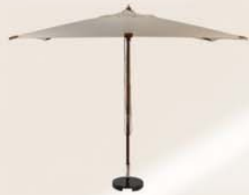
Parasol in Natural