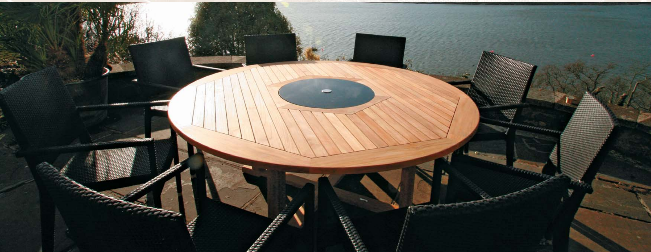
table size: H75 x L180/120 x W120cm • chair size: H93 x W57 x D44cm