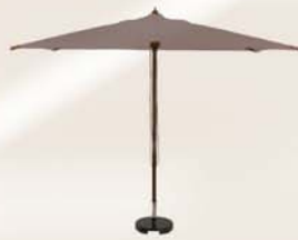
Parasol in Taupe