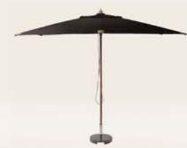
Parasol in Black

We have a range of cushions and recliners available in all the above colours, more more information please contact us or visit our website.