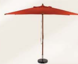
Parasol in Terracotta