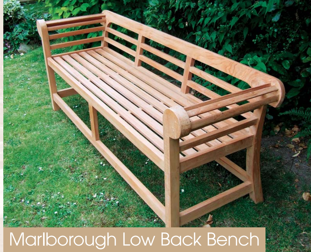
Marlborough Low Back Bench