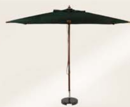
Parasol in Green