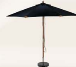
Parasol in Blue