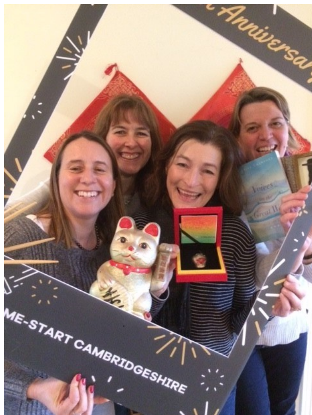
Pictured are four of the volunteers

We have five intrepid volunteers trekking The Great Wall of China to raise money for Home-Start Cambridgeshire.