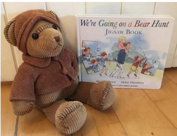
Children who attend our Cambridge Group went on a Bear Hunt!