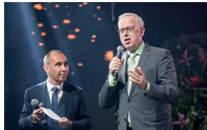
AIPH-President Bernard Oosterom presented the coveted Floralties awards.

farms and a number of floral events and garden festivals. Nantes takes pride in having 57 m 2 of green space per person with everyone in the city living within 300 meters of green space.