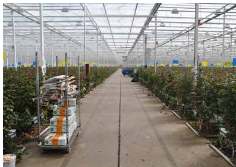
High pressure sodium grow lights supply 156 micromoles / m 2 / sec. in winter.

In the beginning, generating demand was easier said than done and undoubtedly much more time consuming than when selling Mexican-grown tomatoes in the USA. Corella recalls that one single visit to a big box store was often enough to sell his entire year's produce. In contrast, Aleia's predominant Dutch customer base, that is Royal FloraHolland based floral wholesalers, took a wait-and-see attitude at first. Now that the company has launched its Aleia Maxima brand, under which it sells its premium quality roses in stem lengths 60,70, 80 and 90 cm, it has found its path to bloom and able to deliver the cream of the rose crop. In all independent trials, Aleia roses score high on trust and vase life. The company has invested in its