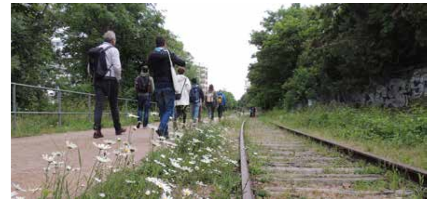
La Petite Ceinture (Little Belt) promenade is more about rewilding the city and creating traffic-free pedestrian routes than presenting a designed landscape.

Paris offers many examples of green initiatives throughout the city. Although home to many internationally famous historic gardens, such as the Tuilleries Garden, Paris cannot rely on its past glories. To cope with the challenges facing cities, particularly one as densely populated as Paris, Pénélope Komitès, Deputy Mayor of Paris, declared that 100 hectares of additional green space will be installed by the end of 2020. Mme Komitès urges city authorities to strengthen the place of nature in their cities, and to do so in consultation and collaboration with residents so that they take ownership of the change. The Végétalisons Paris programme, intended to develop and cultivate new spaces for nature in the city, provides free planning permits to residents who wish to add greenery to their neighbourhood. There are 1,329 completed projects, including rooftops gardens, green walls, fences, balconies, potted plants and tree surrounds.