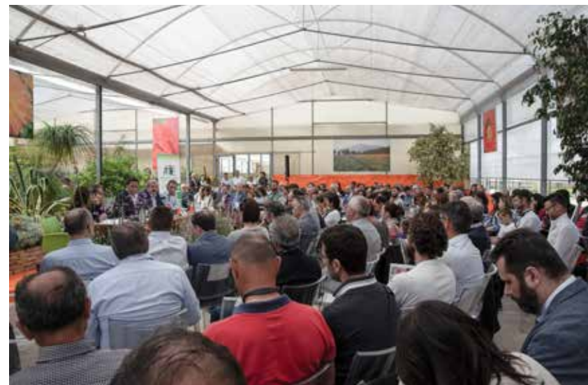
The ANVE meeting was held on site at Vivai Capitanio nursery near Bari, Puglia.

There is no doubt that Xylella remains the focus of the Italian industry, particularly in Puglia. Nurseries here are likely to be more receptive to the new regulations as they are already confronted with responding to an industry catastrophe without clear procedures in place. This certainly highlights that prevention of introduction of new threats is far preferable to managing control. This view is further strengthened when the industry considers how use of agrochemicals is becoming less acceptable, with many bans anticipated or already in place. Regulation 2016/2013 applies to all EU member states, which supports uniform and strict systems that safeguard not only horticultural and agricultural businesses, but also forests and natural areas. The proactive approach that ANVE is taking serves as an example for other countries to follow.