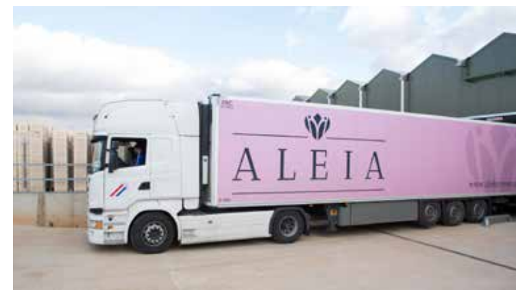
Flowers travel comfortably on water that keeps them hydrated even with a daily truck ride to the Netherlands taking around 19 hours.

The roses are grown hydroponically with the first of a total of 1 million young rose plants being planted onto the raised gutters filled with rockwool slabs in the autumn of 2016. Throughout the initial stages of its business cycle, Aleia Roses has endured a number of technical challenges. A greenhouse grown rose crop needs time to mature to full production and crop engineers have not always found it easy to tame the