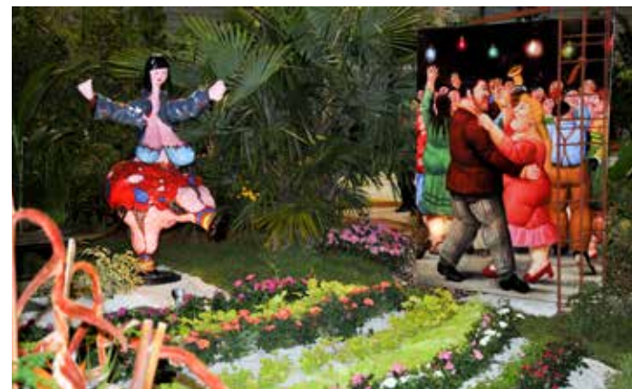
Colviveros is the Association of Colombian Nurseries and Ornamentals Growers. They had turned their Boterostyle garden into a colourful display

Vying for attention was a beautifully landscaped Alice in Wonderland garden celebrating the qualities of young children: naturally imaginative, curious and able to play without a worry in mind. A creation of the city of Changé the garden clearly took inspiration from Tim Burton’s movie.