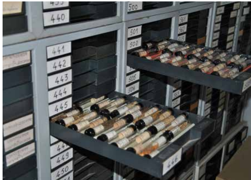
GEVES hosts one of the world's most important seed collections, stored in tubes and include 17,000 species of cultivated and adventive plants from around the world. The seeds are dry stored (and therefore no longer able to germinate) and used in seed physical purity testing of commercial seed lots to identify seeds from different species.

Cereals, oilseed, barley but also vegetables, salads and ornamentals; the vast majority of crops produced around the world come to life with the sowing of a seed. Seeds are life but are also of immense biological and economic importance with the USD 59.71 billion global seed market dominated by the big five: BASF, Bayer, Dow, Dupont and Syngenta (ChemChina), accounting for more than half the sales of seeds, crop protection products and fertilisers in the world. According to Michael Muschik, former Secretary General of the International Seed Testing Association (ISTA), there is no doubt that “seeds have been the most important and the most crucial means of production ever since mankind has worked in plant production and agriculture”. Seeds have turned into a global commodity with seed quality touted as one of the most critical factors in the establishment of a uniform plant stand, marking the first step in producing a successful crop, particularly now that there are growing concerns about a rapidly increasing world population to feed, changing weather patterns and the spread of new crop diseases.