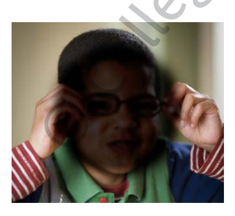
Advanced stages of AMD (wet and dry)

The commonest form of late AMD is the wet form. This happens when abnormal blood vessels begin to grow behind the macula and leak fluid. This pushes the macula away from its blood supply at the back of your eye and causes a rapid loss of vision. It is usually associated with you noticing distorted vision (straight lines become wavy, or you have a blank spot or smudge in the centre of your vision).