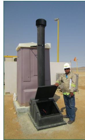
Mine workers are using Enviro Loo at Langer Heinrich Uranium Mine.