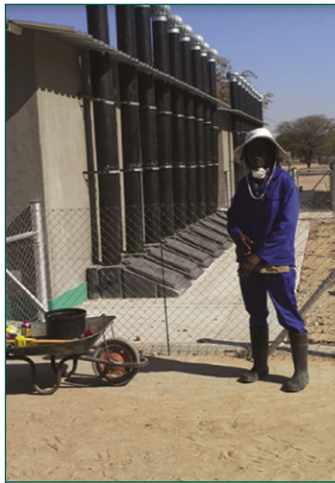
Learners are using Enviro Loo at numerous schools in North-Central Namibia.