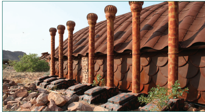
Tourist travellers are using Enviro Loo at the Twyfelfontein World Heritage site (above) and Bloedkoppie.

In Namibia, the Enviro Loo system is successfully used in different environments. Below are some examples: