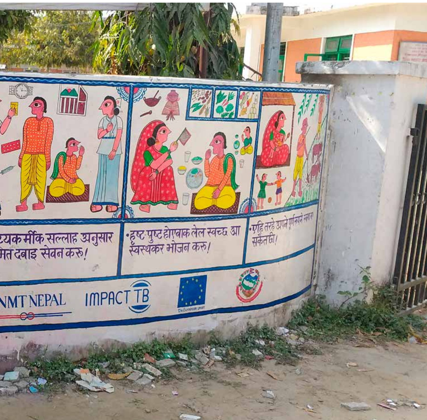
TB mural in Dhanusha

survey result was also impressive. The findings portrayed a 47 per cent increase in knowledge among respondents who had participated in both pre-test and post-test survey.'