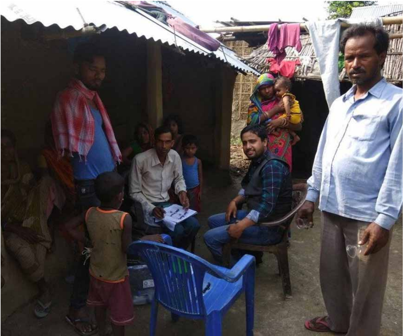
TB screening in Morang