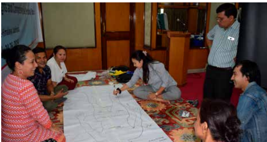
Staff training session on SHSR

In this project, BNMT is working to improve the knowledge and understanding of SRHR, and how it links to mental health, among teachers, students and parents in the municipality. We hope to encourage better communication about sexuality between parents and young people. We are also building the capacity of three local civil organisations to advocate for SRHR as a basic human right.