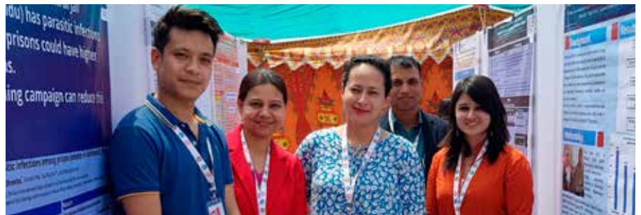
BNMT staff at the National Summit of Health and Population Scientists in Nepal