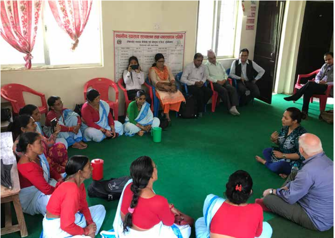
Training session with female community health volunteers