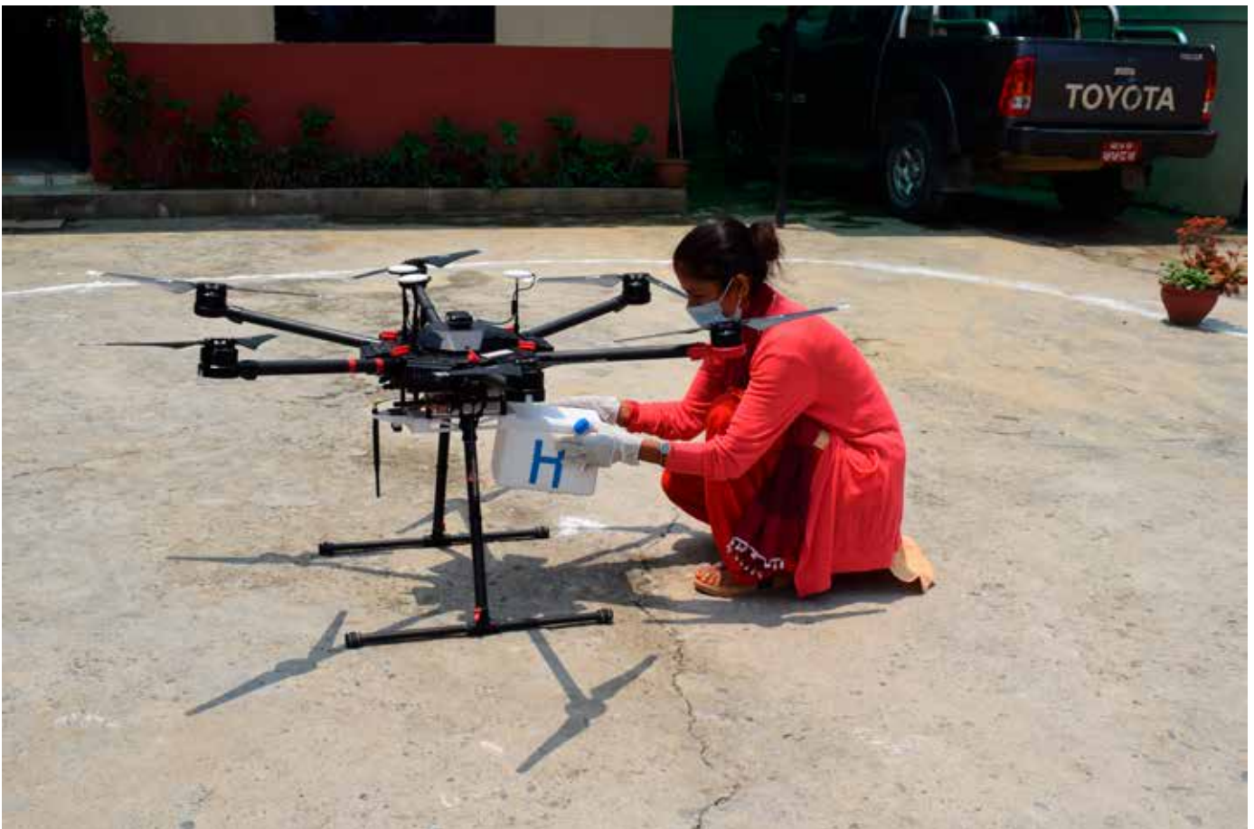
Using drones to transport sputum samples for testing

If this project succeeds, there are many more potential applications, such as delivering drugs and other medical supplies in emergency cases.