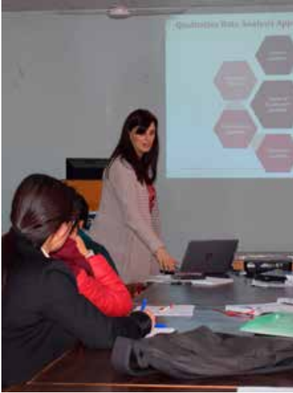
Training in research methods for BNMT staff