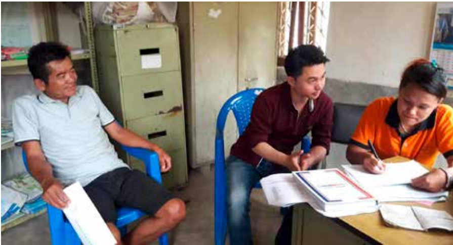
Analysing survey results

Although TB testing and treatment are free of charge in Nepal, patients and their families incur costs when they use TB services.