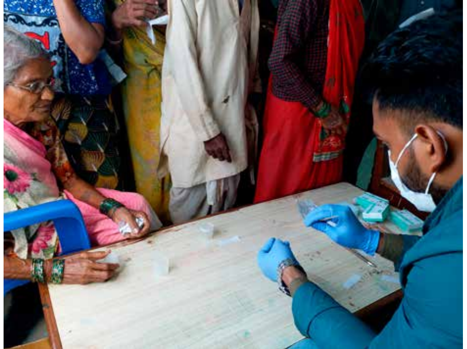
TB screening at a microscopy camp in Kapilvastu

In the TB Reach project, BNMT is making diagnosis and treatment more accessible in disadvantaged communities in Western Nepal.