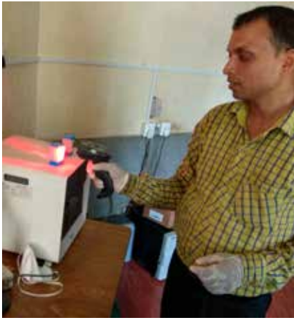
Running a cartridge scan before a GeneXpert test