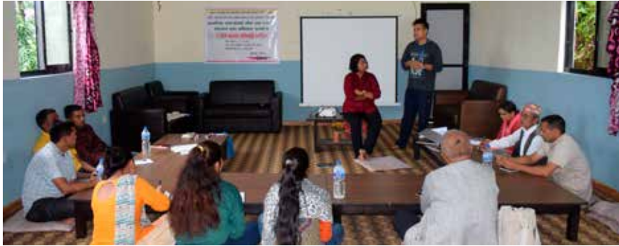
Workshop with civil society organisations in Sindhupalchowk

BNMT is working with people in earthquake-affected villages to improve young people's sexual health by increasing their knowledge and advocating for their rights.