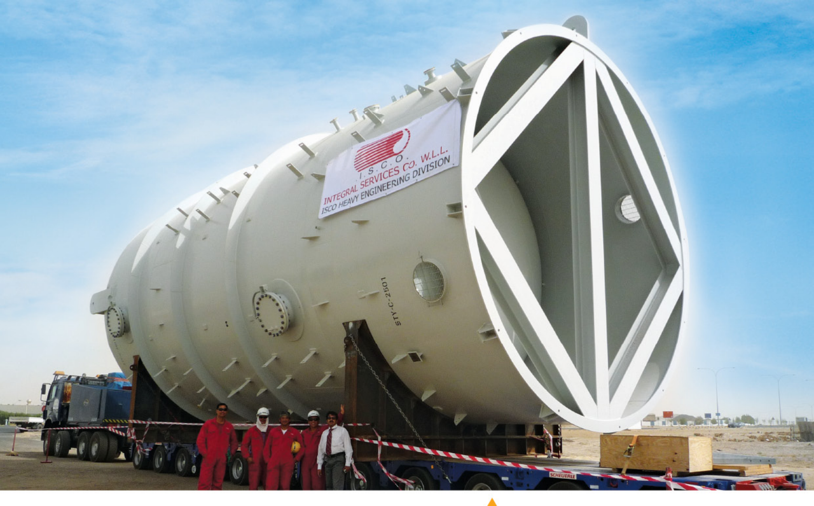
Equate Oilfien II EBSM, Shuaiba L 15m x W 6.7m x H 8.1m G.Wt.110 Ton Delivery Location: Shuaiba Equate. Crossed over busy traffic through Mina Abdullah-Shuaiba Refinery and transported to site.