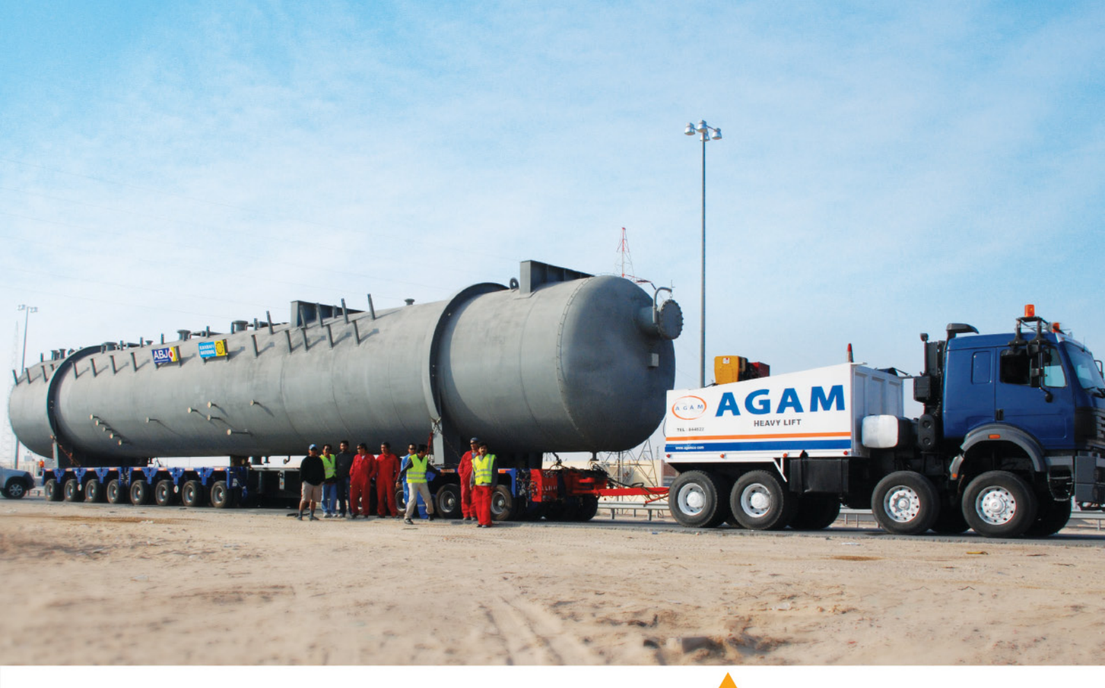
South Oil Co., Basra, Iraq Mina Abdallah, Kuwait to Basra. L 29m x W 4.55m x H 6.5m G.Wt: 66 Ton