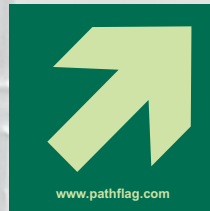
PF7 68 x 68