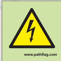
PF2 68 x 68