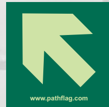
PF8 68 x 68