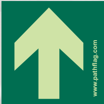
PF1 68 x 68

Choose from the selection below or design your own (Minimum quantity of 50 applies for specials)