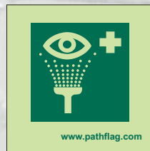
PF11 68 x 68