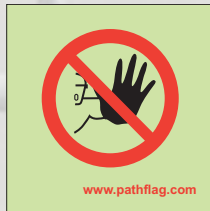
PF6 68 x 68