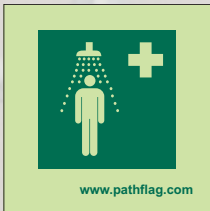
PF5 68 x 68