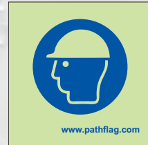
PF4 68 x 68