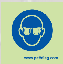
PF9 68 x 68