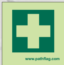
PF10 68 x 68