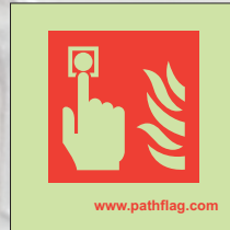
PF3 68 x 68