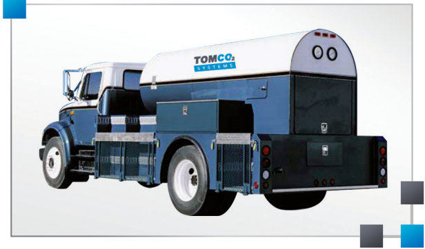
2 1/2 Ton Delivery Unit

We also offer this exceptional unit as a DOT combination liquid CO_2 storage unit with specially designed areas for high pressure cylinders.