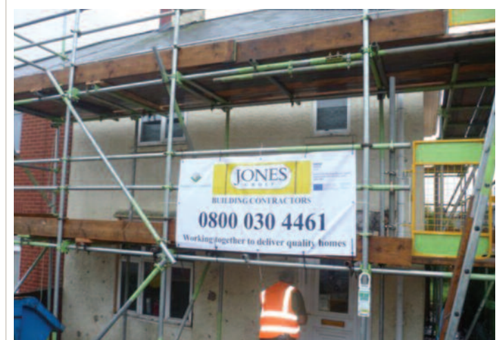
Exeter City Council, Laing Project

Works are progressing well to 12 bungalows at Case Gardens, Seaton. The work involves the complete rip out of properties and providing gas heating installs, complete rewires, new kitchens and wet rooms, full internal decorations, carpets/ vinyl flooring, new roof tiles, foot paths and garden works.