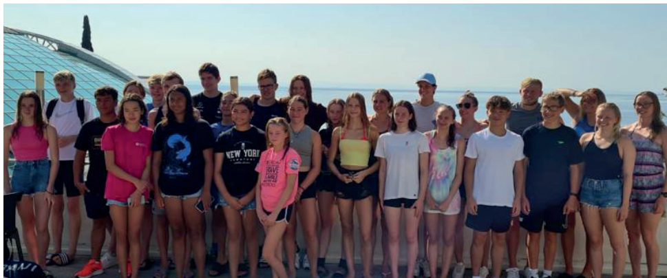
Kantrida Swimming Pool Complex, Croatia

Swimmers of Venom, Mosquito and Vampire & + squads spent a week in Rijeka, Croatia at the end of August for a pre-season camp. They swam twice a day and also enjoyed some activities that included waterslides at an aquapark and water-ski or wakeboard on a sea cable tow. They trained hard, had fun, enjoyed the hot days, discovered new friendships under the supervision of coaches Janko and Pippa. The training sessions also included open-water swimming in the sea. They swam with fishes and parents could even spot dolphins doing some jumping not far from the swimmers! They had an amazing week ready for the new season to come.