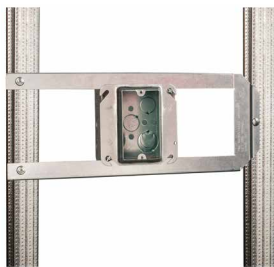
Less than 14" stud spacing (use only 1/2 of the bracket)