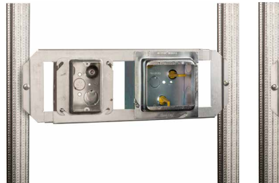
"14" to 25" stud spacing"