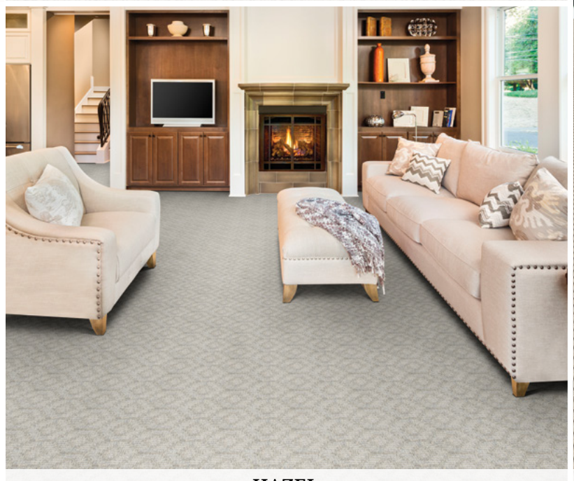
\begin{tabular}{ll} \textbf{HAZEL} \\ \textbf{100\% UNDYED NATURAL WOOL, HAND-LOOMED FLATWEAVE, 15' WIDTH} \\ \end{tabular}