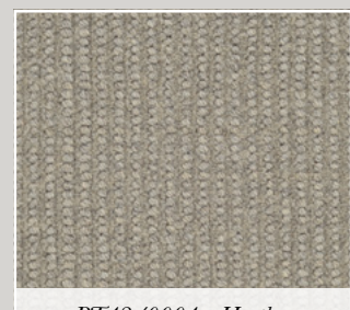
PT42/0004 - Heather