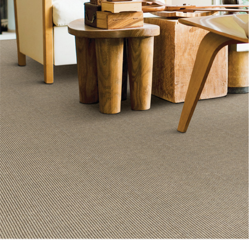
CHESTNUT 100% UNDYED NATURAL WOOL, HAND-LOOMED LOOP PILE, 15' WIDTH