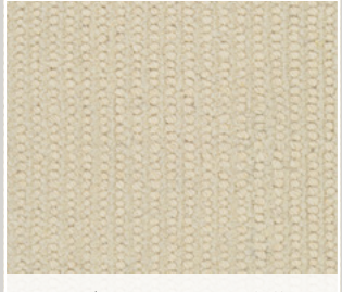
PT42/0001 - Eggshell