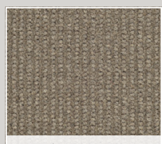
PT42/0005 - Pepper