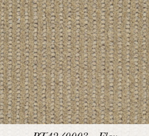
PT42/0003 - Flax