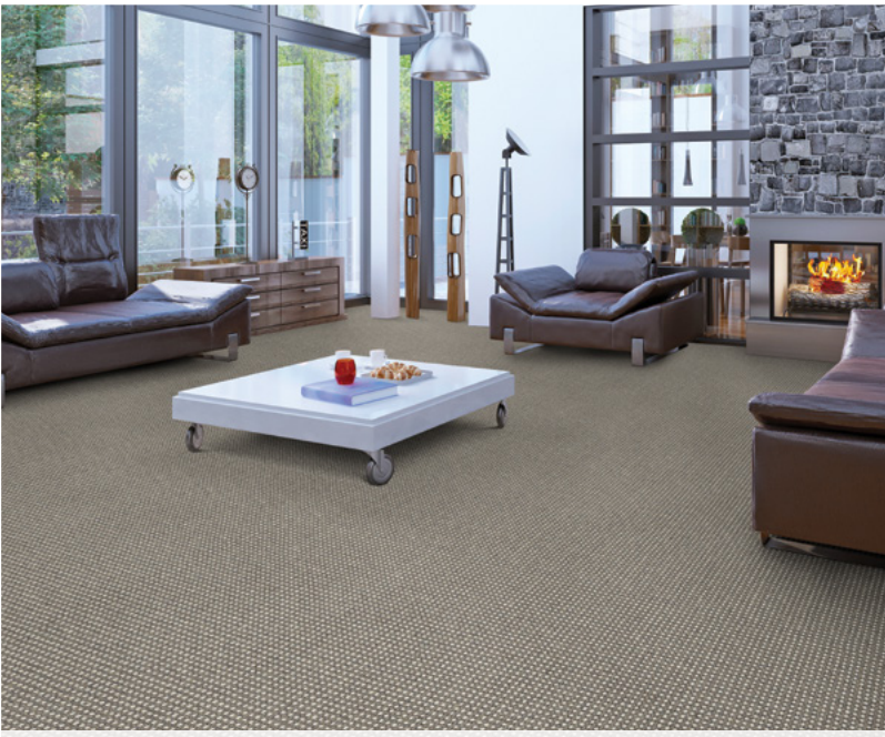
BUTTERNUT 100% UNDYED NATURAL WOOL, HAND-LOOMED LOOP PILE, 15' WIDTH