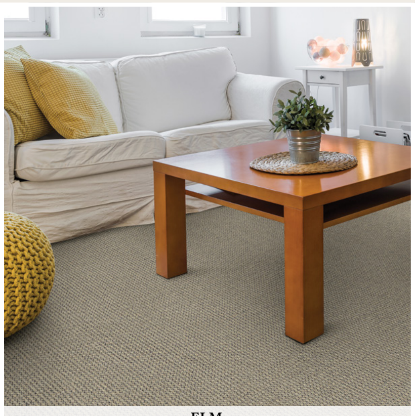
ELM 100% UNDYED NATURAL WOOL, HAND-LOOMED LOOP PILE, 15' WIDTH