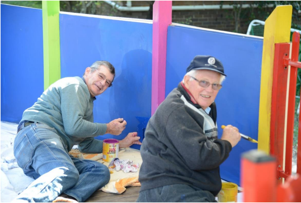
Hard at work at West Pennant Hills School