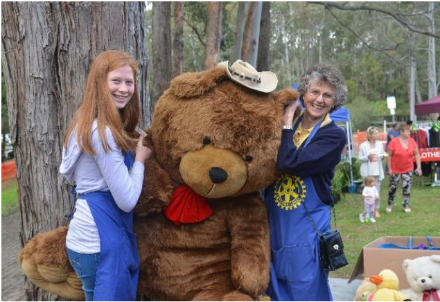
Bear sold at Garage Sale!