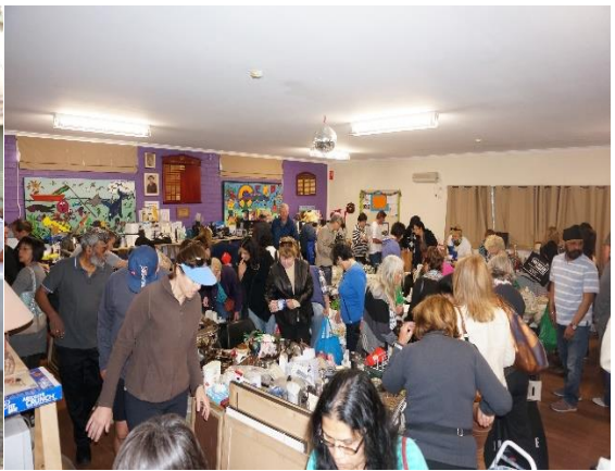
Bargain Hunting frenzy!