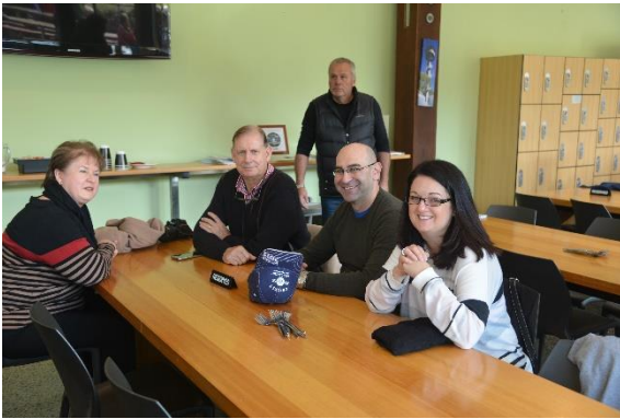
Where's lunch? We're starving!