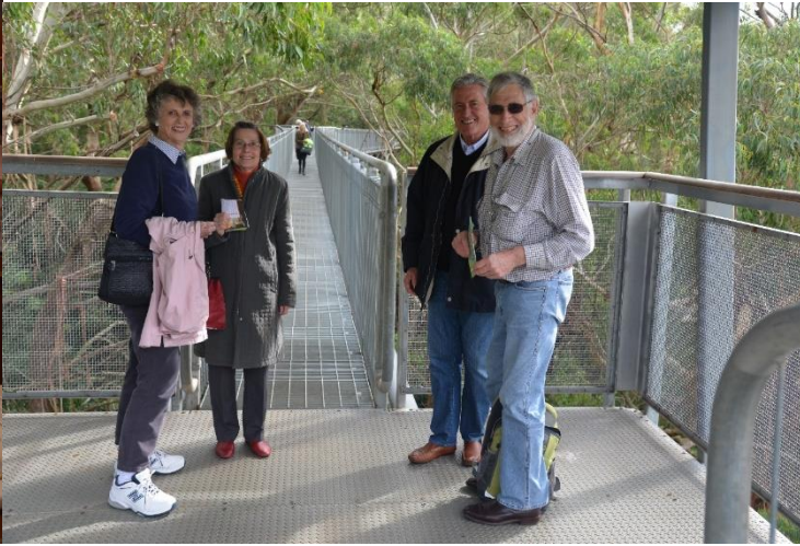
High in the tree-tops at Illawarra