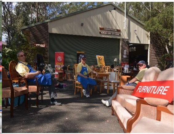
Hard working furniture salesmen!