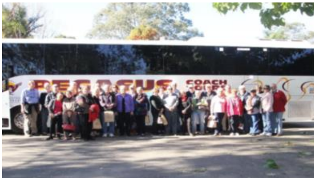
The Bateman's Bay Tour Group