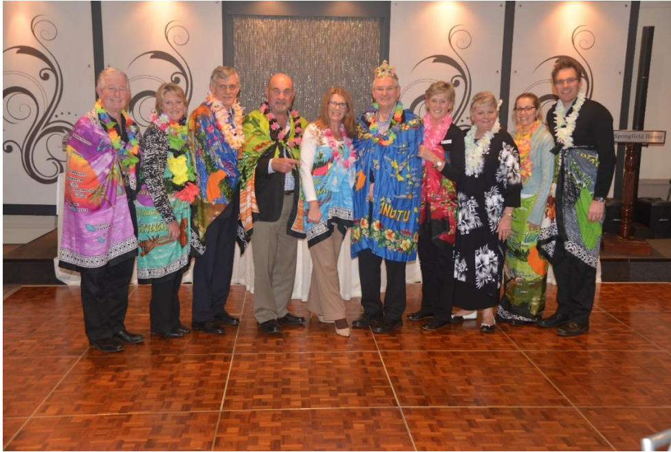
The Vanuatu Team in “National Costume”