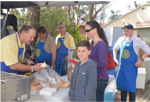
Will you have sauce with that?