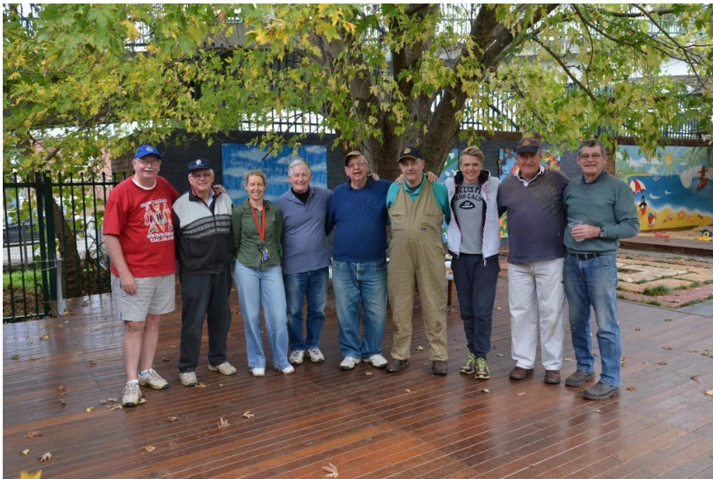
Another Rotary Project Completed