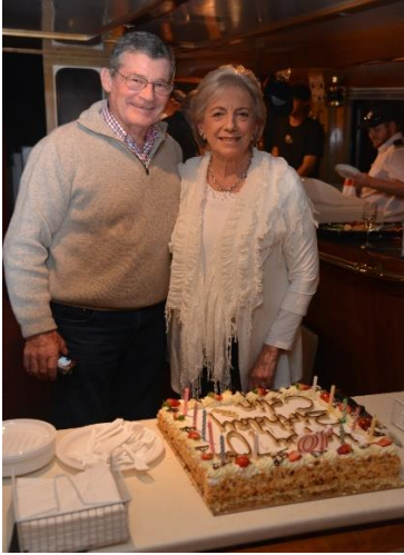
Col's birthday celebration On the Clyde River