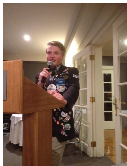
Maxx's Final Speech