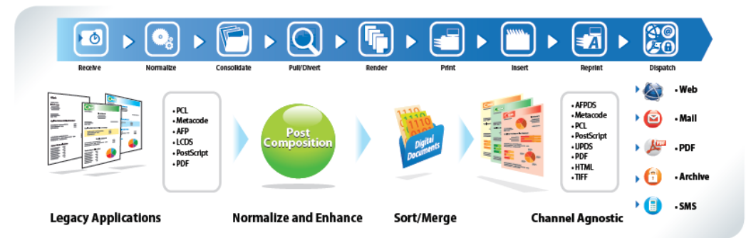
Figure 2: Workflow Automation

The concept of a digital document strategy centers on enhancing and preparing customer communications before they are rendered in their final distribution format. This is accomplished by increasing access to personalized and market-driven content through composition or post-composition solutions. These tools are a critical component to enable organizations to cost-effectively modify legacy documents and embrace multi-channel customer communications. Establishing a centralized service to modify the myriad of business applications post-composition can help bypass often-painful overhauls of legacy systems by creating a small number of centralized utility programs that can service the distribution needs of multiple legacy applications—saving time to market and costly remediation efforts. For instance, you can use these tools to add color and personalized messaging, as well as index and render documents for electronic delivery. The concept is to take legacy output from various business systems, apply the necessary business, operations, and marketing changes, then render the communications in the consumer's preferred format.