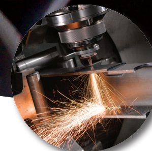
Laser Tube Cutting