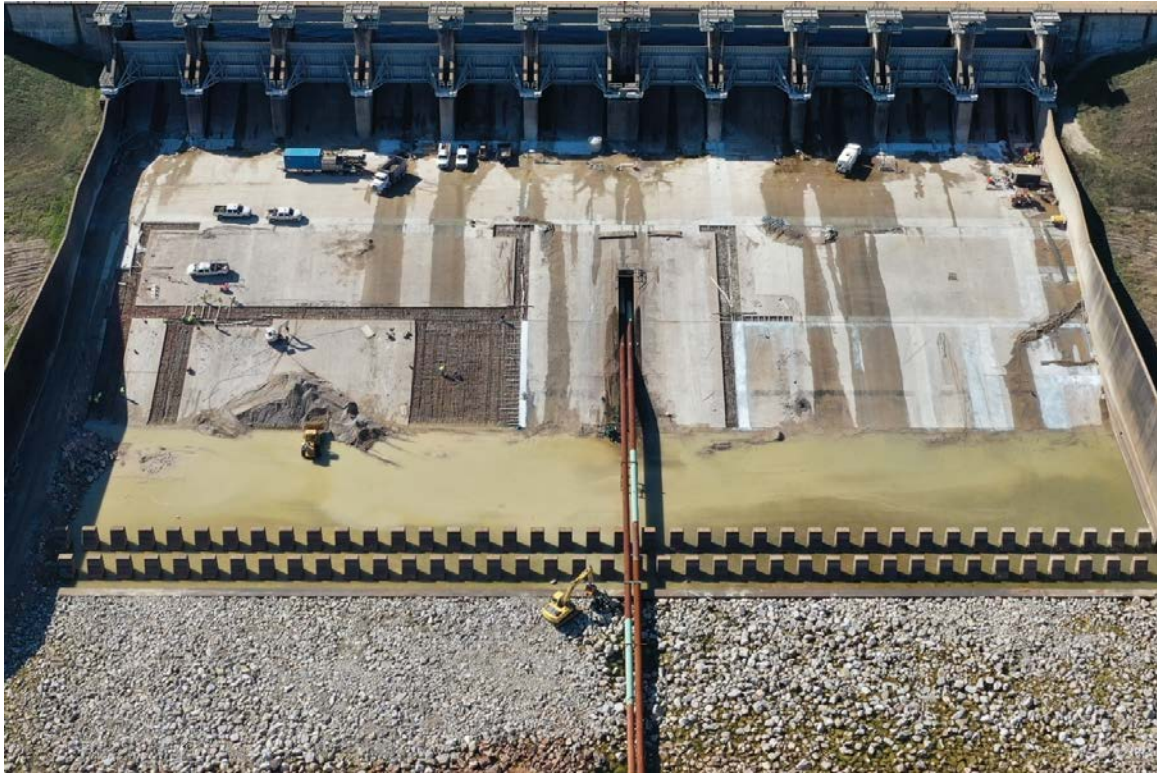
TB Spillway showing concrete removed by hydro-demolition and recently placed concrete

Although the project took longer than expected due to weather conditions, lower lake levels provided a good opportunity for residents along the shoreline to inspect and make necessary repairs to boathouses, piers, retaining walls and related structures since it had been several years since a significant drawdown had occurred.