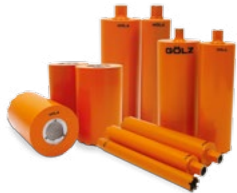
Diamond Drill Bits 1¼" UNC