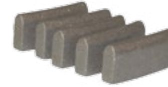
Roof segments 25-500 mm