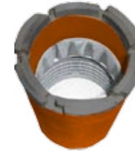
Deep drilling system with or without core lifter