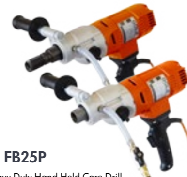
FB23P / FB25P

3-Speed Hand Held Core Drill. For hand held or drill stand operation