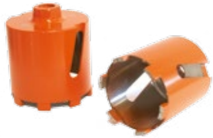
Dry Drilling System without hammer for joint boxes