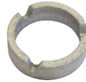
Ring segments 10-50 mm