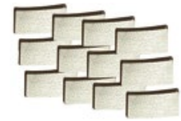
Galaxy segments systematic diamond arrangement