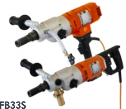
FB33P / FB33S

2-Speed Heavy Duty Hand Held Core Drill. Compact Core Drill for anchor and installation holes