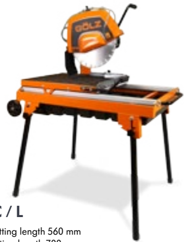
MS350C / L

MS350C - Cutting length 560 mm MS350L - Cutting length 700 mm Blade Ø 350 mm