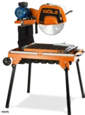
BS400E / P