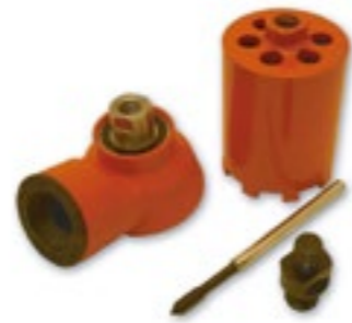
Drill swivel for sucking off the dust by standard industrial vac