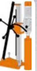
Extension tube 500, 750, 1000 mm