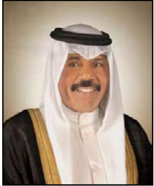
His Highness Sheikh Nawaf Al-Ahmad Al-Jaber Al-Sabah The Crown Prince