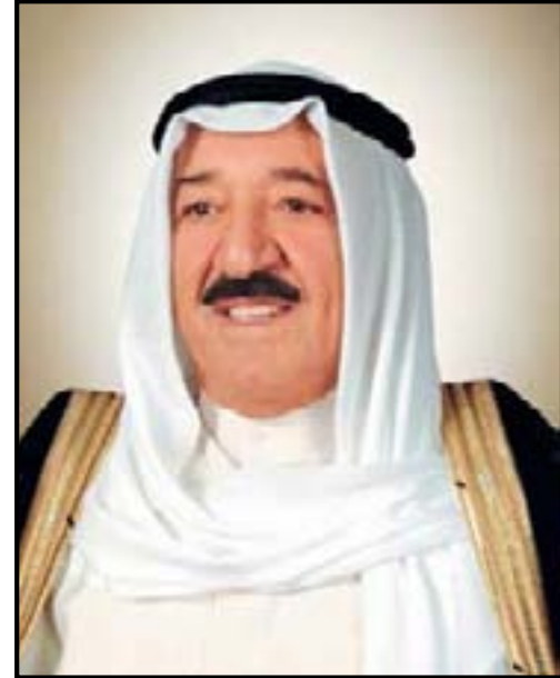
His Highness Sheikh Sabah Al-Ahmad Al-Jaber Al-Sabah The Amir Of Kuwait