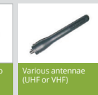
Various antennae (JHF or VHF)