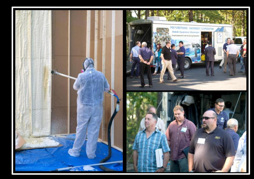
21-23 September 2016. ON-Site Foaming demonstration of PolyMac's new spray gun extenshion handles, which allow easier treatment of large, high wall surfaces.