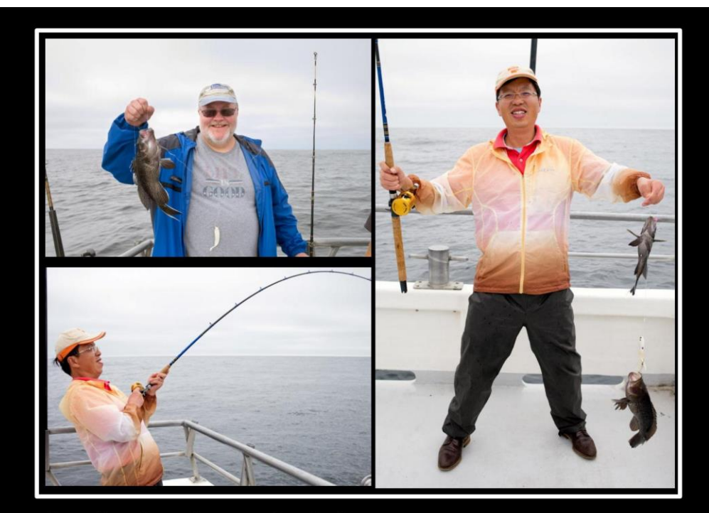
ONE OF THREE FRIDAY PROGRAMS: DEEP SEA FISHING ....