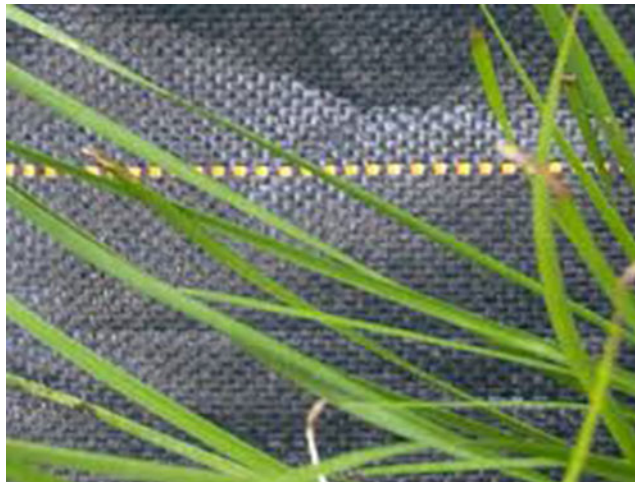
Weed mat effectively stops the growth of weeds - at least for a while!

Keeping the insects off your plants is the most effective way of keeping them from eating your plants. You keep crawling insects off by putting weed mat on the ground around your troughs; and flying insects off by putting floating row cover on over your troughs. Inside your house, a greenhouse, or a screen house will also provide protection.