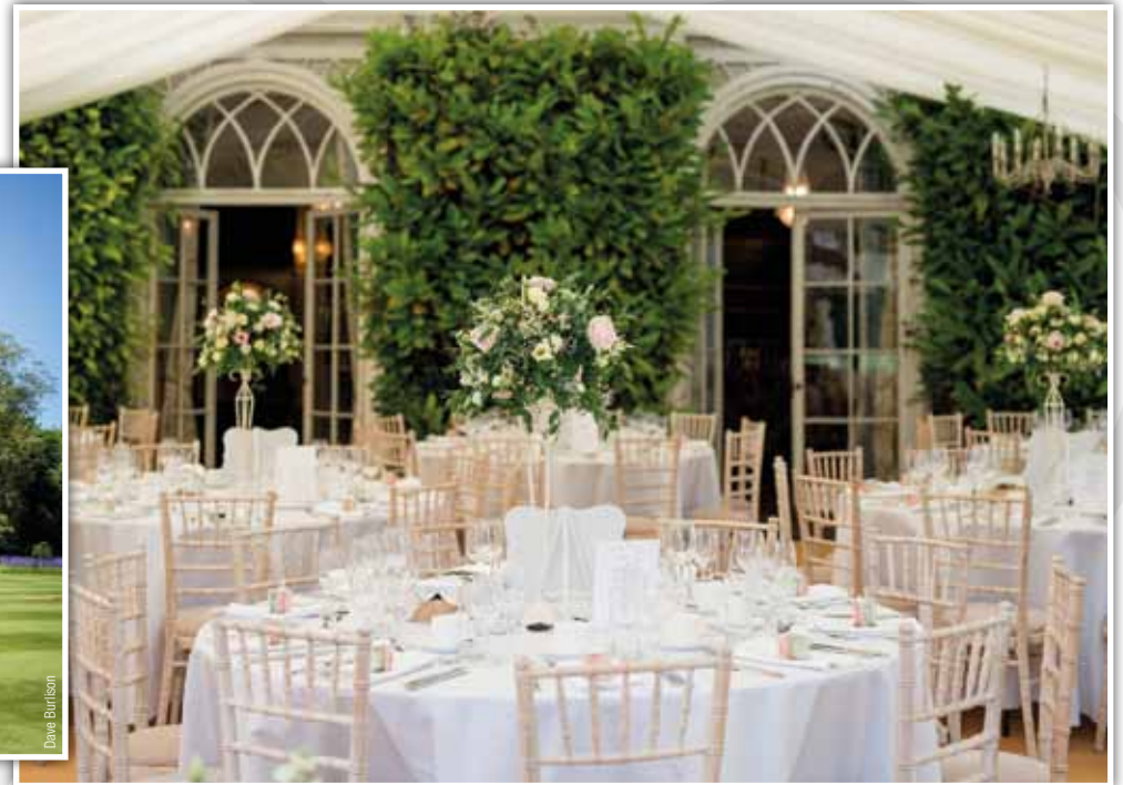
A marquee can adjoin the Library for larger receptions.

The Zoffany Room is a charming and versatile room, perfect for smaller parties and private meetings, providing a relaxing and peaceful environment.