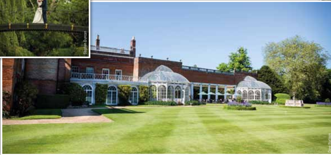
The conservatories flank the Orangery overlooking the South Lawn.

The Ballroom is an opulent classically proportioned room on the first floor with stunning views across the Hampshire countryside. Its grandeur provides a beautiful and romantic backdrop for a wedding ceremony.