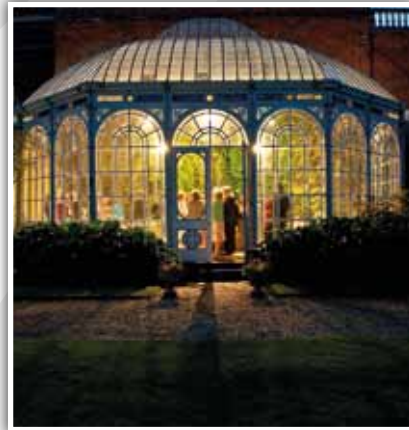
Lemon Tree Photography

Avington staff will be happy to help you organise your special occasion.