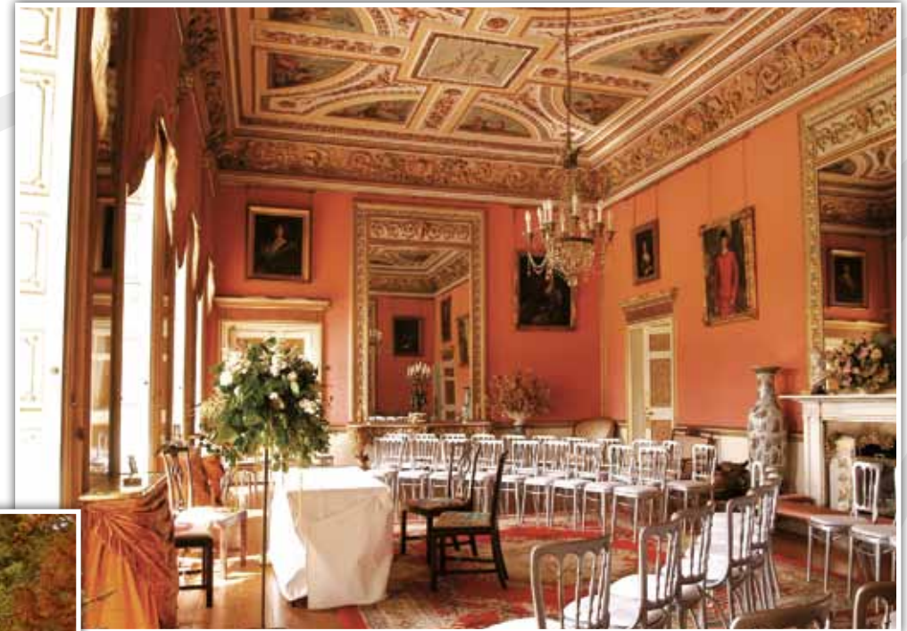
The Ballroom ↑ and the Library ↓ both licensed for wedding ceremonies.

With only exclusive use offered, Avington Park can ensure your special event is a memorable and prestigious occasion.