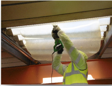
Cutting out the rooflight

This process alleviates the need to install safety netting, external scaffold and access equipment whilst greatly reducing the risk of serious injury or death.