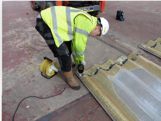
Using the exiting rooflight as a template