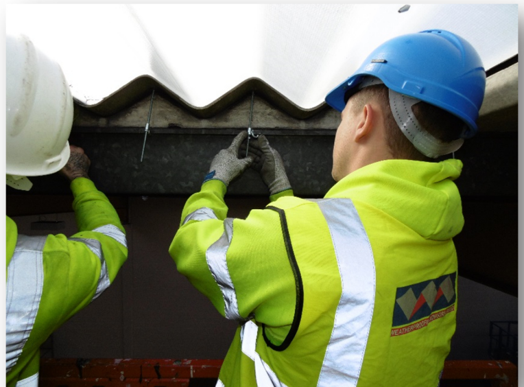
Installing the rooflight