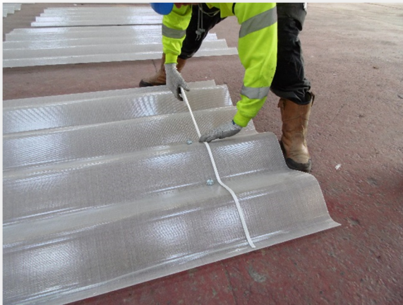
Preparing the rooflight