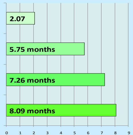
Reading Age Gain in Months