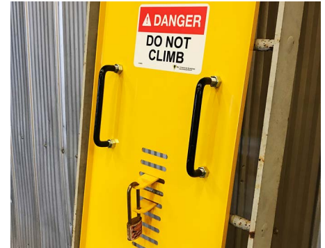
Padlock hasp for commercial applications