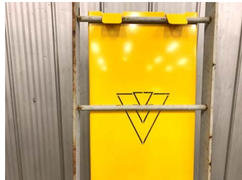
Step 1. Hang guard on ladder