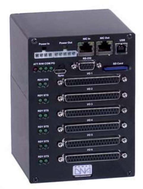
Coda supports compact I/O chassis

The piping data monitored in real-time are exported to analysis packages such as the SO Analyzer e-Reporter from m+p international or Microsoft Excel for comprehensive analysis and reporting. The ultimate step is using the SO Analyzer e-Reporter. It provides test engineers with extensive capabilities for browsing, viewing, editing, analyzing and reporting data as well as with full ActiveX compliance.