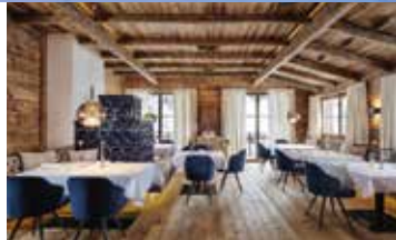
Clockwise from top left: Severin*s at dusk; late-afternoon swims await; modern interiors in Switzerland; the spa setup at Tivoli Lodge