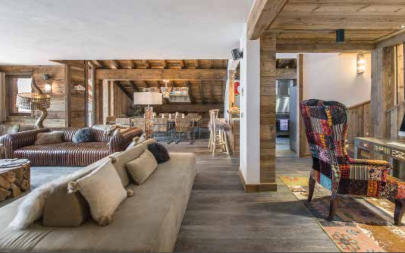
Left: relax in Méribel Village. Below, clockwise from left: lemon tart; lemon drizzle cake; breakfast pancakes; sleeping under the eaves; the approach to the chalet; a healthy start to a day's action; dinner is served; floor-to-ceiling windows make the most of the stellar view