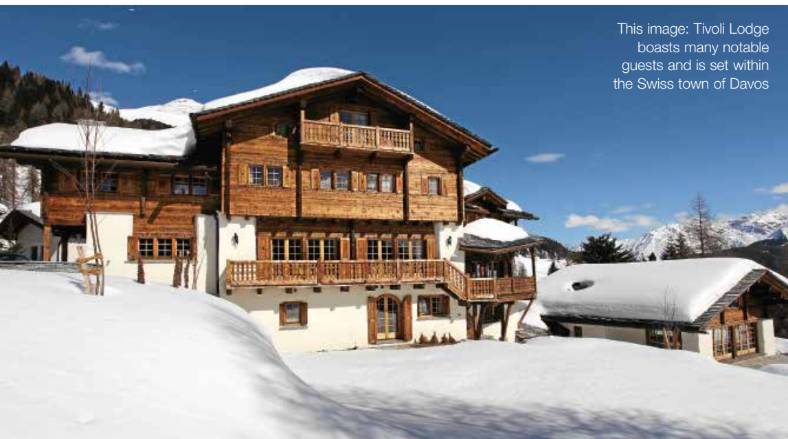
This image: Tivoli Lodge boasts many notable guests and is set within the Swiss town of Davos