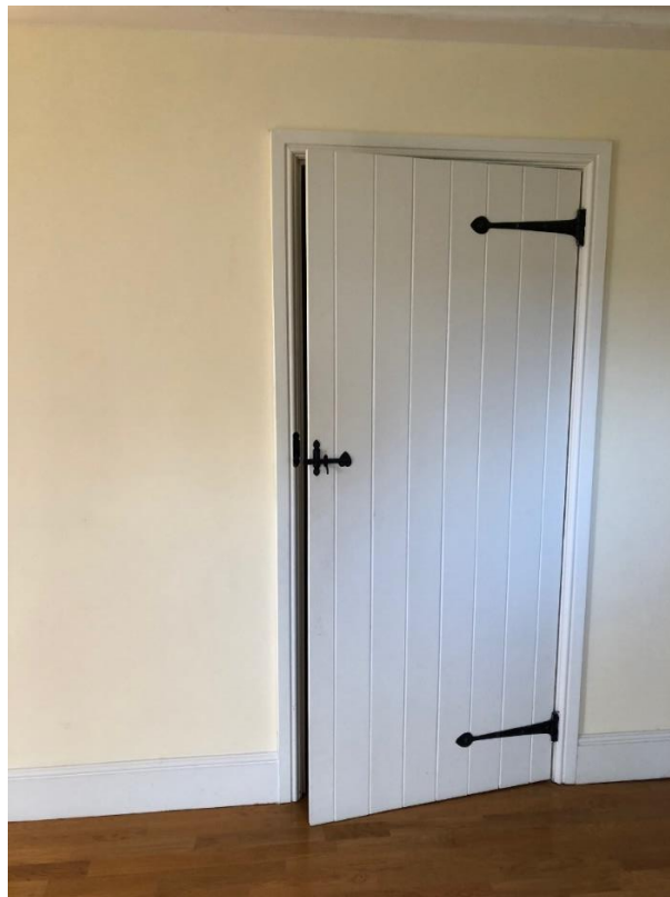
Colour contrast on walls and doors

We have colour contrast between walls and doorframes.