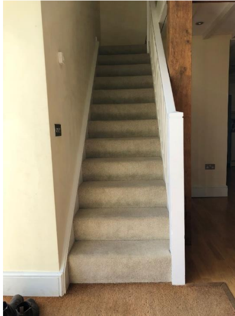
Stairs to first floor