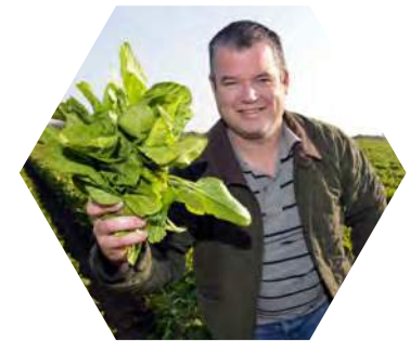
Meet the Grower