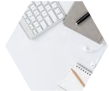
Working with Cooperatives