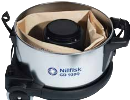
Durable steel container and 15 litre dust bag