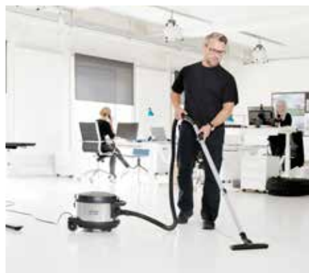
The GD 930 is the perfect choice for demanding applications such as offices, hotels and public buildings