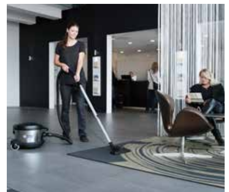
The new GD 930Q is specially built for noise sensitive areas with a low comforting background noise pressure level of only 42 dB(A)