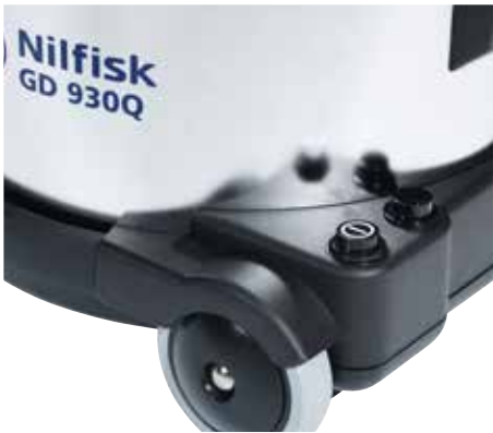
Dual speed function