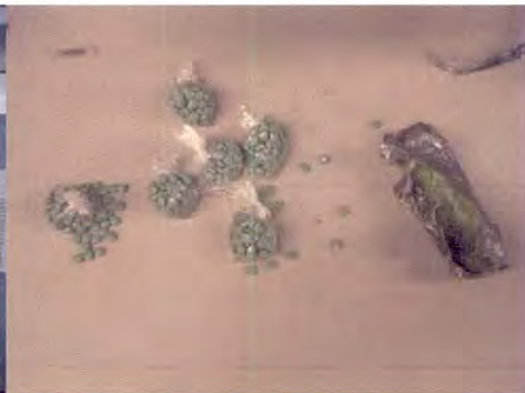
Confiscated drug items