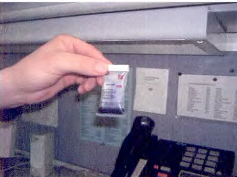
Testing for marijuana