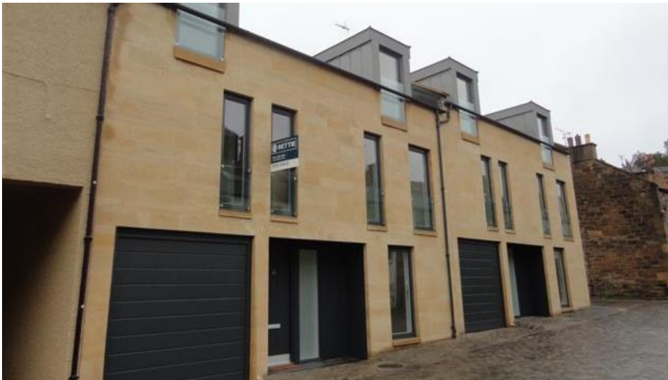
Witton Fell ashlar to a residential development