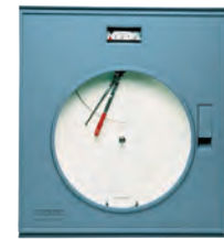
40P Recording or Indicating Pneumatic Controller