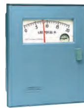
43AP Pneumatic Indicating Controller