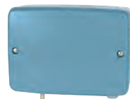
44B Series Blind Pneumatic Transmitter