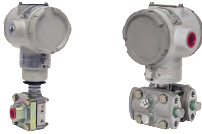
STA, STD & STG Transmitters