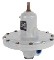
95 & 98 Series