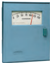
45P Pneumatic Indicating Transmitter