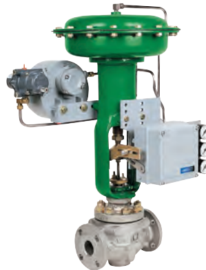
Sliding Stem Valves