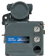
DVC6000/6200 FIELDVUE® (Remanufactured)