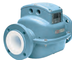
2800 Magnetic Flowmeter