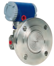
IDP10/PSFLT Flush Diaphragm