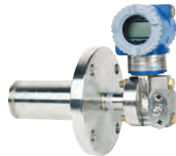
IDP10/PSFLT Extended Diaphragm