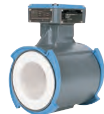
8000A Magnetic Flowtube