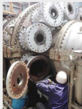
Major inspection of gas turbine.