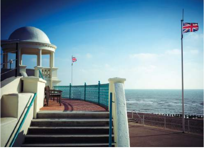
Union Jacks fly at Bexhill-on-Sea