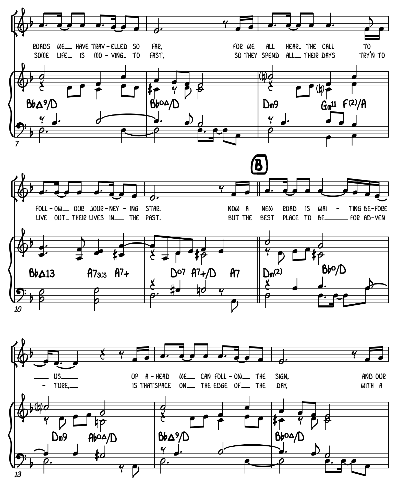
THE ROAD TO TOMORROW - LEAD SHEET