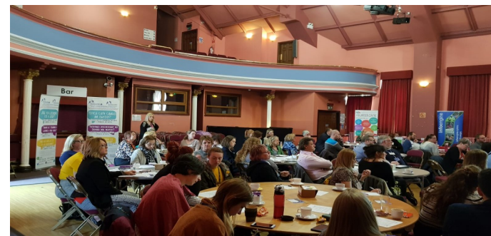
A Busy Event!!