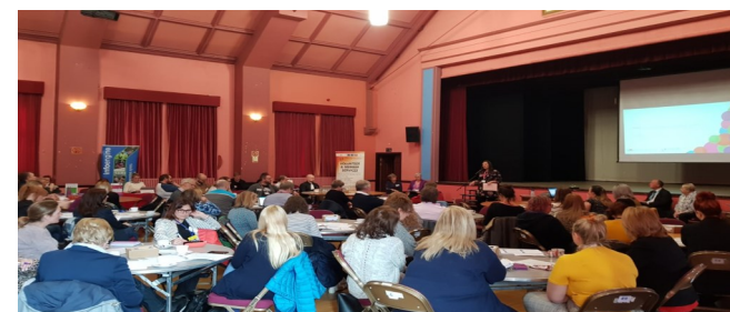
Fiona Liddell, WCVA