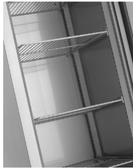
Non-Gastronorm Shelving System With Anti-Tilt Slides

Precision's durable all stainless steel cabinets have been designed to provide commercial caterers with reliable, energy and cost efficient refrigerated storage solutions. Proudly made in the UK, these slimline cabinets are capable of meeting the highest demands of commercial kitchens all around the world - especially when space is at a premium.