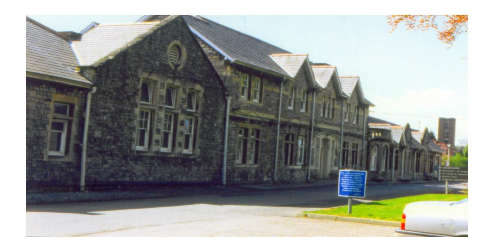
Ely Hospital Project