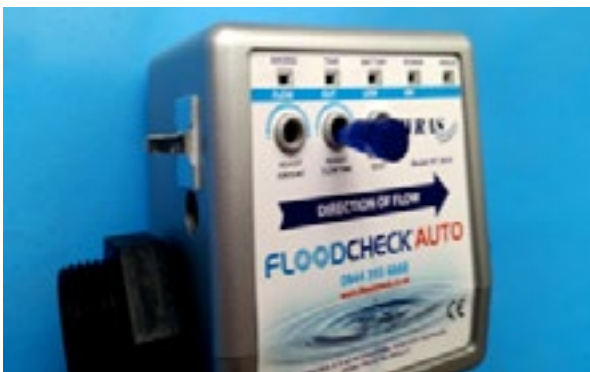
ADJUSTING THE TIME OUT

NOTE. Turning the taps off and on again will give you another time out period.