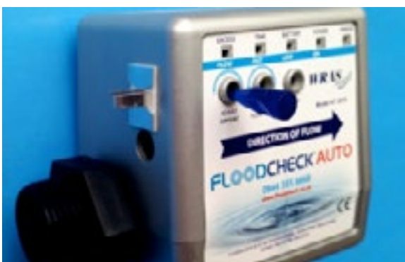
ADJUSTING THE EXCESS FLOW