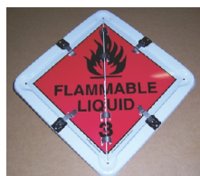
FLIP FLOP PLACARD R30 - Metal 345x345mm Outer Dimensions 275x275mm Diamonds