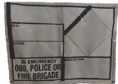
H282BANNER 600x800mm Tanker Placard with plastic pockets allows details to be changed as required Velcro fasteners ensures information is secure

Tanker Placards should be affixed directly to the Tanker in the form of a label or as a metal sign or banner (as pictured above) permanently attached to the structure of the transport unit. In any case the sign needs to be clearly visible and un-obstructed and in contrast to its surroundings making it easily identified.