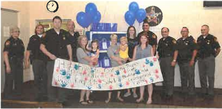
Back to the Blue Appreciation Event