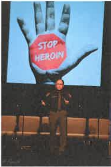
Community Awareness Event