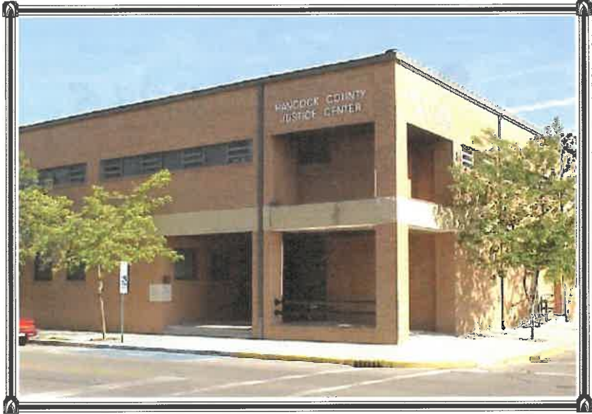
Hancock County Justice Center Built in 1989