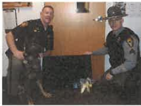
Working together for a Drug Bust