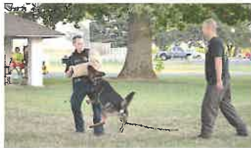
National Night Out Rawson & Mt. Cory