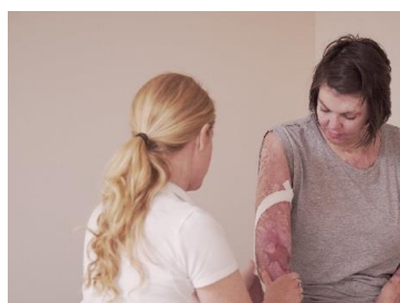
Care at Residential Burn and Scar Rehabilitation Centre

Historically, the National Burn Care Review suggested that the aspirational aim of burn care is to "return the patient to their pre-injury state" and referred to the patient as the "leader" of the burns multidisciplinary team. As the KPF