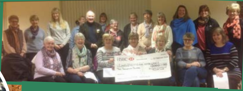
FUNDRAISING EVENTS Epworth District Flower Club £2,000