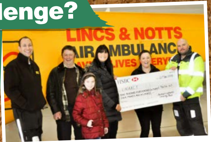
LINCOLNSHIRE FARMERS' BALL £9,434.45