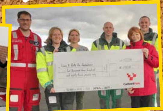
CADWELL PARK £2,483