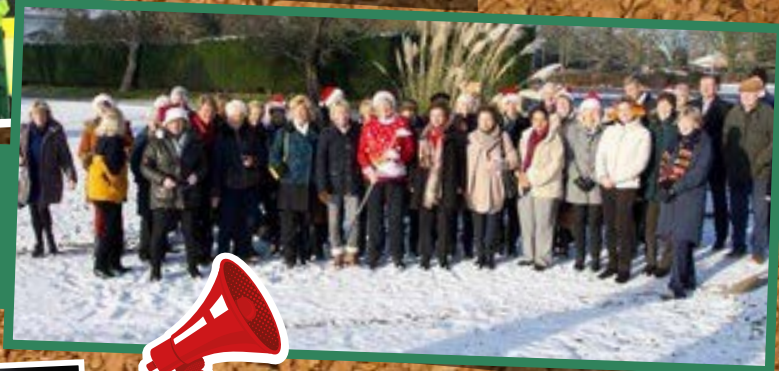
BEER FESTIVAL Grimsby CAMRA £467