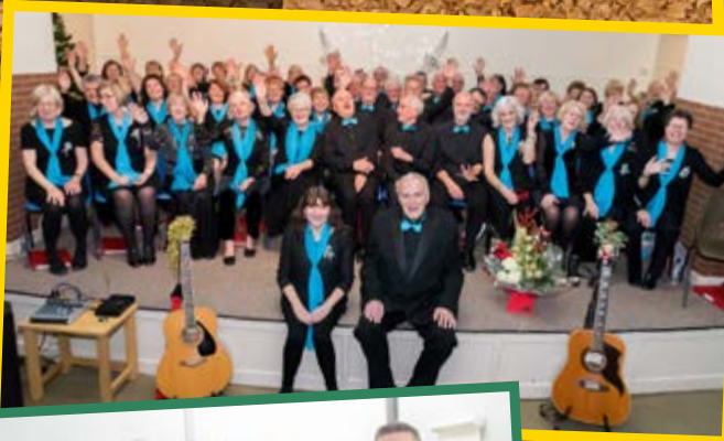
UNDERWOOD CONCERTS Rock n Soul Singers £1,000 so far!