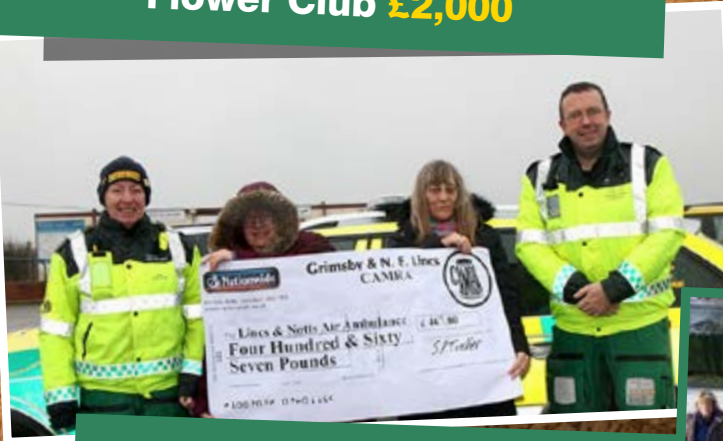
LADIES' CAPTAIN'S DRIVE IN Beeston Fields Golf Club £150