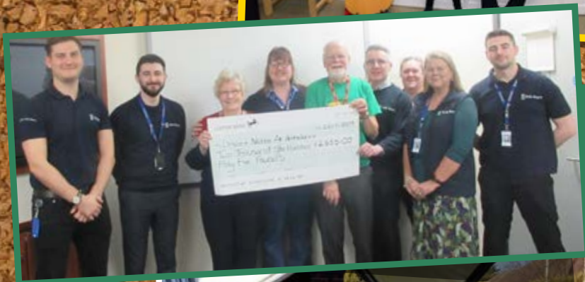
HUCKNALL FUN DAY Rolls Royce £2,655