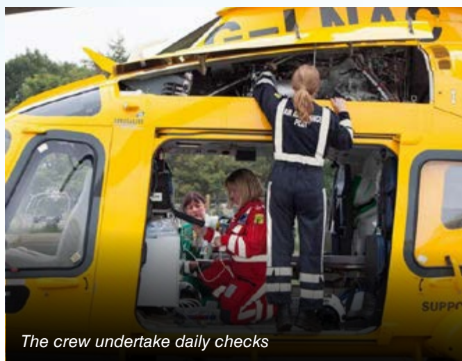
The crew undertake daily checks