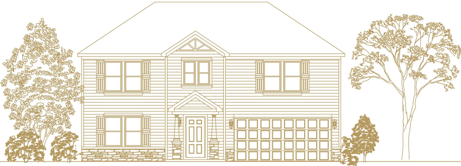
Featured Elevation Elevation Scheme 3