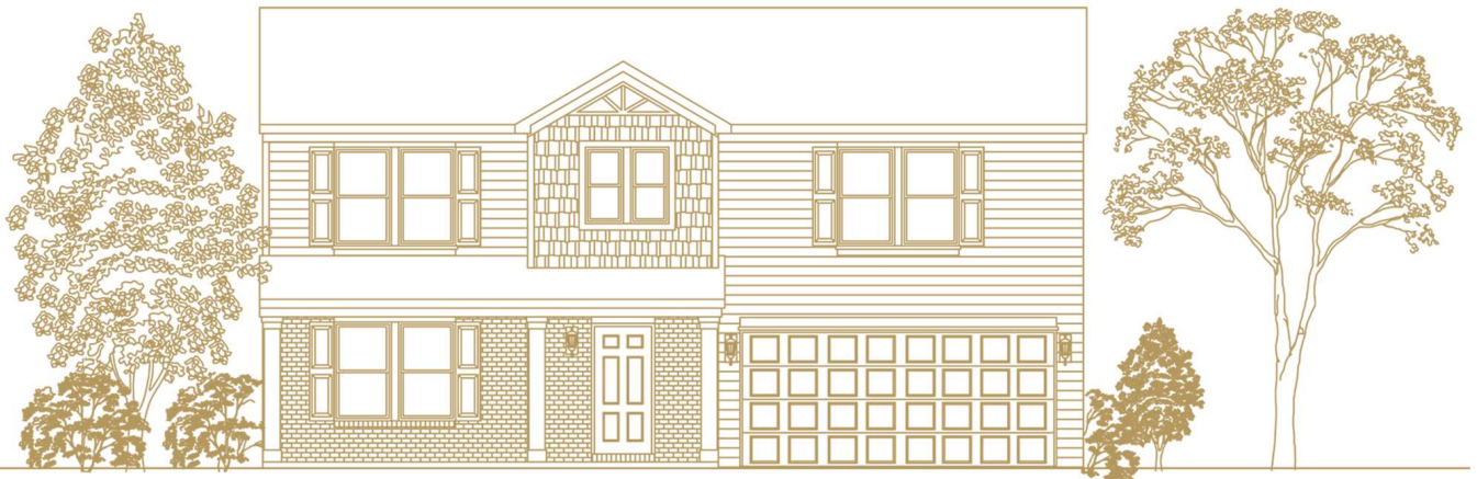
Elevation Scheme 2