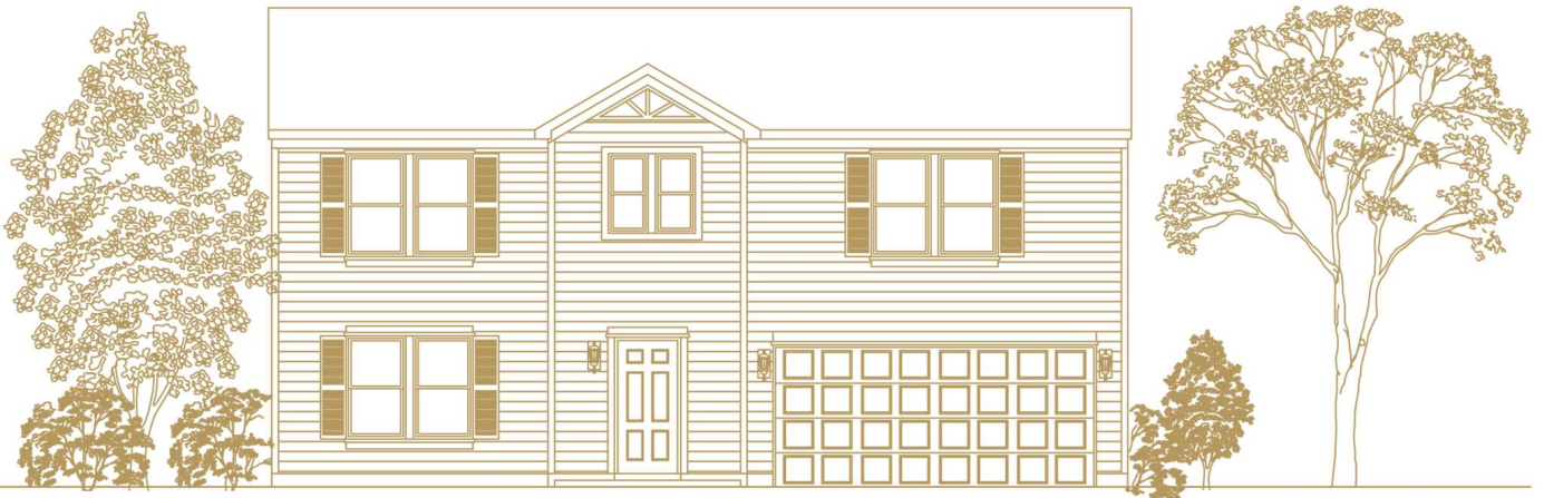
Elevation Scheme 1