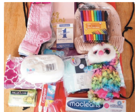
Kindness Kits contain a variety of items that will be sent as a self-contained package to a child in need.

Are you a knitter? We are looking for people to hand-knit clothes and blankets. Could you knit for a child living in poverty, who would welcome a warm piece of clothing in winter? Please post any items you make to our Office.