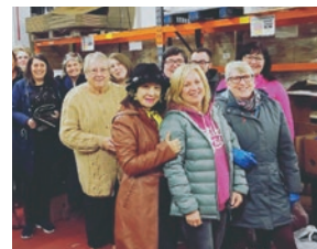
10 Volunteering with Feed The Hungry