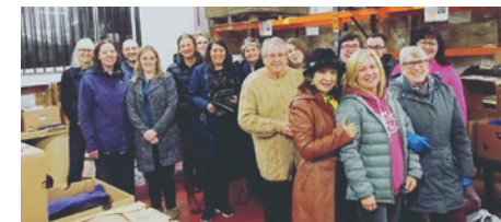
Volunteers regularly come to the Feed The Hungry Warehouse in Hinckley to help sort and pack clothes.

If you are local to Hinckley, Leicestershire, you could help to sort and pack clothes at our Warehouse. Volunteers of all ages regularly come from around Leicestershire and Warwickshire to lend a hand.