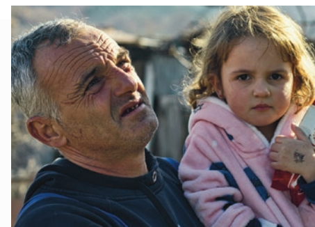
There are many people who have been affected by the earthquake. The support from the government has been limited.

The need is still great. The government cannot, or doesn't seem to want to help. Albania is one of the poorest country in Europe. There have been meetings at the EU Headquarters about financial help for Albania in their effort to rebuild the