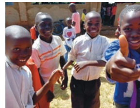
4 God has done it! A Decade of Hope

LeSEA Global FEED THE HUNGRY A full life feels good.™