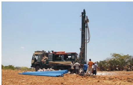
Boreholes have been drilled by Feed The Hungry and our partners throughout Zambia in areas particularly affected by drought.