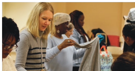
Volunteers sort and pack clothing donated to Feed The Hungry, ready to be sent to support someone in need.