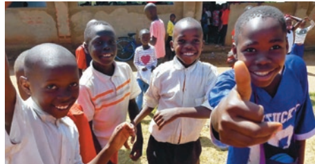
The number of children being fed through our feeding programmes have doubled in the past 4 years. But there is still more to do.

provide water wells in Africa. I had the privilege to travel to Zambia with the two brothers; they had such an amazing love for God and desire to do water harvesting projects in a desert landscape. They spent two weeks drilling bore holes and building irrigation systems.