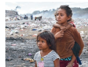
12 They are People