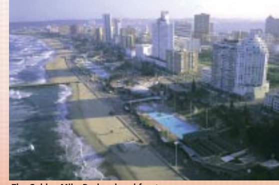
The Golden Mile, Durban beachfront,

IASP International Website: www.iasp1960.org